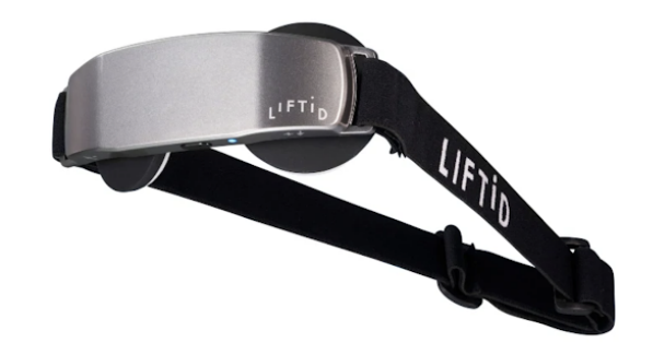
Figure 4. LIFTiD, a commercial tDCS device available that recommends 20 minutes usage a day to maximize attention, focus, and alertness (RPW Technology, 2022).

Currently, tDCS is available online for a fairly cheap price and its popularity is steadily growing. In recent studies, tDCS constitutes a promising therapeutic intervention for psychiatric disorders such as people with major depressive disorder (Bennabi and Haffen, 2018). Commercial headsets have become available as well and are just one click away from users. The headset's stimulation encourages the brain to form new connections enhancing users' process of learning. Professional skiers of the Olympic National team train using electric stimulation headbands known as halo (Yuhas, 2018). Targeted audiences for companies selling tDCS also include the average student who wants to perform better in their next exam although neuroscientists have raised concerns about this practice. There are still many unknowns to what long-term side effects tDCS can have after repeated use as well as how the other regions of the brain will react. Emiliano Santarnecchi, a neurologist at Harvard medical school, also emphasized that each brain is different and that individuals may react differently to the stimulation (Yuhas, 2018).