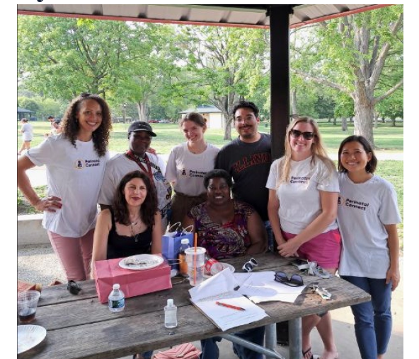
2023 Perinatal Connect Community Event at Hessel Park in Champaign