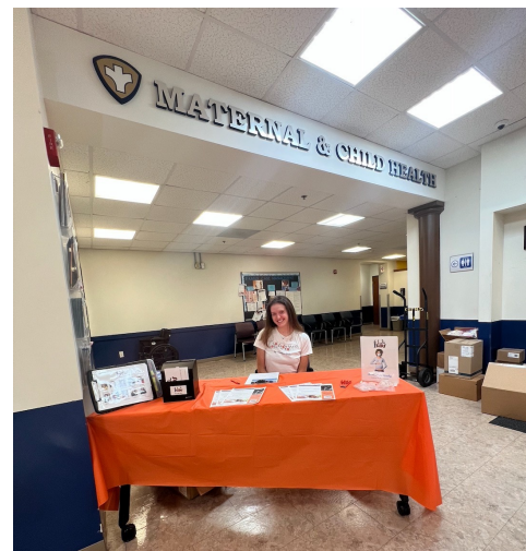
A team of researchers and students from the School of Social Work recruited eligible expectant mothers at CUPHD