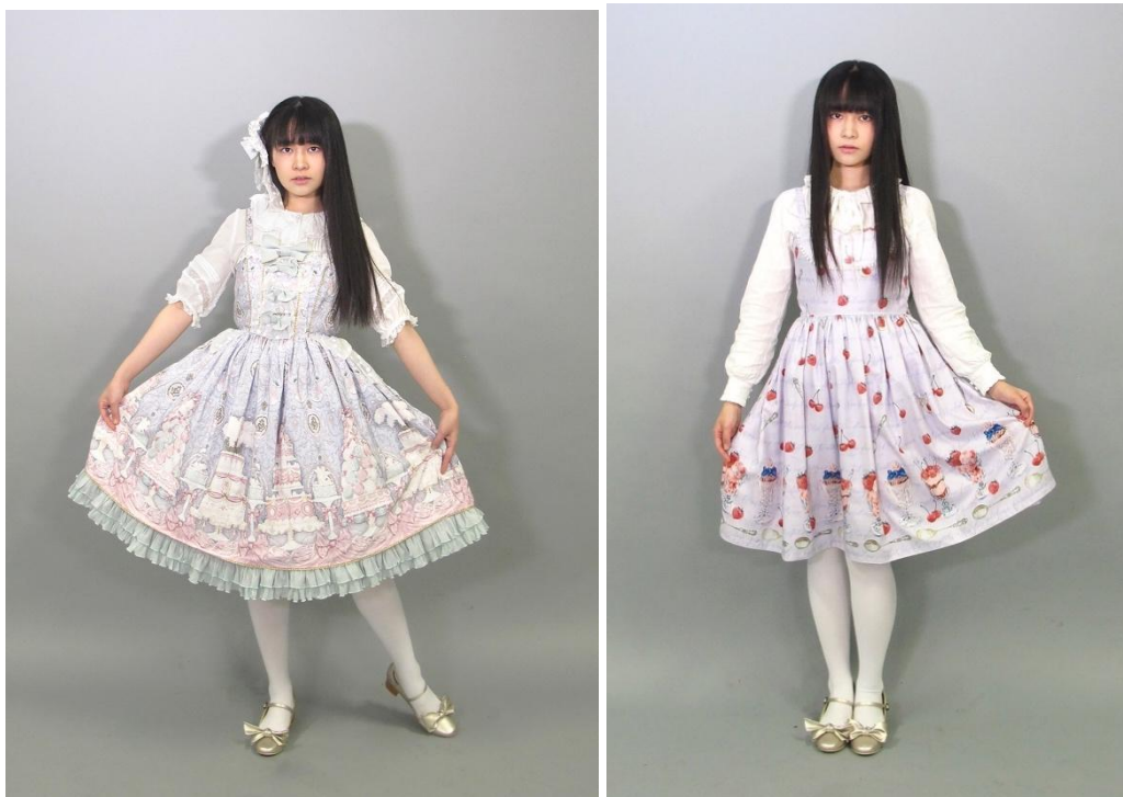
Fig. 4. (Left) A set of Lolita outfit in Ama-loli 甘ロリ “Sweet Lolita” style, which is a variant in Lolita fashion. (Right) Another set of the Sweet Lolita style that looks more quotidian without ruffle or petticoat under the dress. Sweets, fruits, and cakes are typical design elements for a Sweet Lolita dress, often with Alice /fairytale references and in pastel tone (Bernal 64).

Bernal did an attentive study of the Gothic and Lolita subculture in 2011, in which she defines the Lolita culture, or Gothic Lolita in general, as a Neo-Gothic subculture originating in Japan, with multiple variants. The Lolita subculture is a demonstration of “a reluctance to move into the uncertain adult world, a wish to escape reality, and a subconscious desire to remain in, or return to, the security of childhood”, and hence “symbolized in the impulse to dress as a child” (Bernal 51).