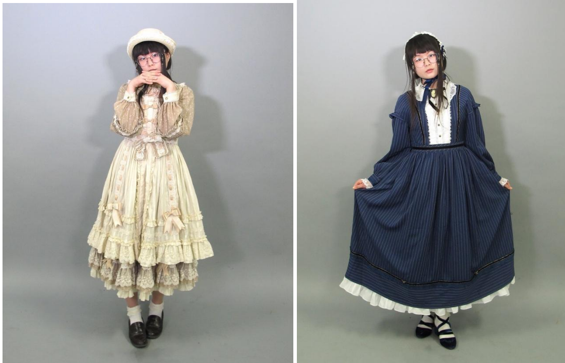
Fig. 5. (Left) A set of Classic Lolita outfit that makes the person appear to be a vintage Victorian doll or child in storybook. “The bodice should finish at the natural waist or just above it, exaggerating the impression of the Child’s physique, and the skirt of the dress will be full-circled or bell-shaped. A headdress is expected and may be in the form of a Victorian-style band, bonnet, or bow headband” (Bernal 55).

The Classic Lolita, as well as the Country Lolita (fig. 6), are much inspired by doll and children’s dresses seen in Victorian-style costumes (fig. 7) and storybooks. An example would be Alice’s dress in the popular story Alice in Wonderland . The story of Alice as well as Alice herself also has become a symbol of a shōjo and her fantasy world, “where such a childhood exists” (qtd. in Hinton 1596).