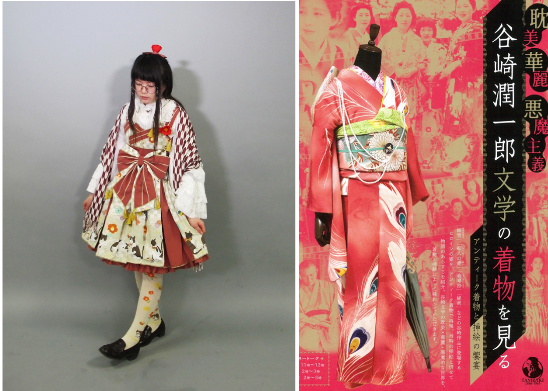
Fig. 1. (Left) A set of Lolita outfit in Wa-Lolita 和ロリータ “Japanese Lolita” style, which is a variant in Lolita fashion. Wa-Lolita features a fusion of Western and traditional Japanese designs and patterns, reminding of the Taisho modern fashion in Tanizaki’s Naomi .