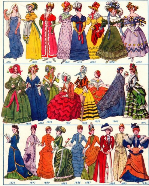
Fig. 7. “Illustration depicting fashions throughout the 19 th century” in “Victorian Fashion”.

Fig. 6. (Right) A set of Country Lolita outfit, such design is generally inspired by the countryside and Victorian farms, marked by floral pattern, frill, sometimes an apron, and with accessories such as a straw hat, as shown in the figure.