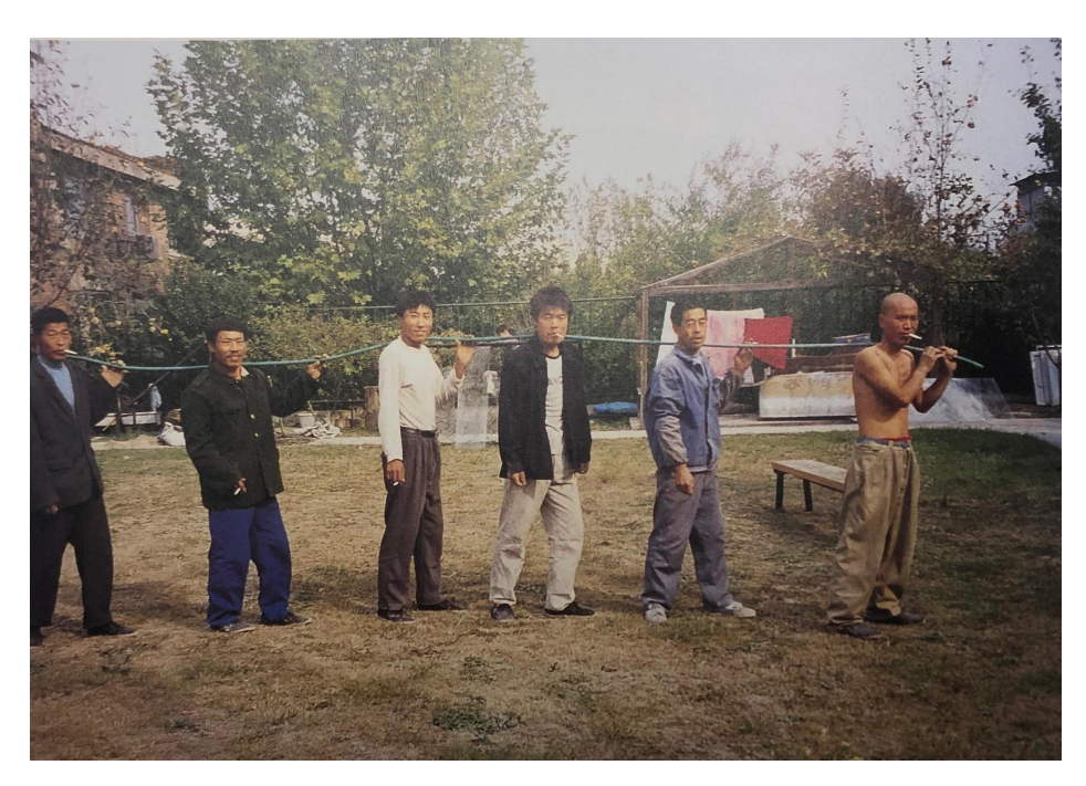
Migrant workers in yard of my studio, Liu Xiaodong, photograph

As I have mentioned before, Liu's practice of combining fragments from photographs is also applied in this painting, which results in an abrupt disconnection between figures and landscape. Without the reference of Three Gorges in the title, no direct association of that region can be made from only viewing the painting. The landscape only functions as a backdrop behind the human figures. Instead of responding to the alteration of landscape, Liu primarily focuses on human activities and represents a chaotic scene of a variety of people in this painting. This group of six labors is placed dominantly in the foreground. They are neither situated in the landscape nor interacting with it. Their distinctive costumes, motionless gestures, and emotionless facial expression, all make it as a staged performance.