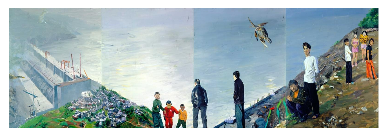
Newly Displaced Population, Liu Xiaodong, 2004, oil on canvas

Similar to the painting Great Migration , Newly Displaced Population was also reproduced from photographs in Liu's studio in Beijing. The fragment of the duck comes from a photograph in a magazine. Figures that were depicted in the two paintings are not all locals from the Three Gorges area. Since they are fragments from photographs, the element of three children appears in both paintings, but a different composition in the larger scale with more detailed depiction in Newly Displaced Population . According to Liu's photographs, two young men on the first panel on the right are from Baidicheng, and three prostitutes on the same panel were photographed by Liu in an apartment in Beijing, who also appear in Liu's painting Prostitutes No. 9 in 2001. In this painting, different people from different places were juxtaposed with the landscape of Three Gorges, representing a disjunctive presence (Decrop 101). Liu's use of fragments becomes more explicit in his painting Hotbed No.1 ; without the use of photographs, fragments of time and space still exist by painting from life on site.