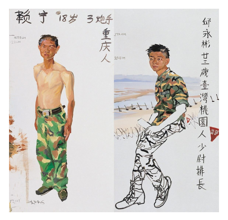
Battlefield Realism: Images of the New Eighteen Arhats, Liu Xiaodong, 2004, oil on canvas

In addition to the intensity of emotion that it conveys, for Liu Xiaodong, good artwork also depends on the amount of information it shows (Wu 6). Therefore, to help him to deliver more information within the limitation of the medium of oil on canvas, Liu chooses to combine elements from different photographs, incorporating these disparate fragments into one single painted image, and arranging them in an unusual combination (Liu 58). However, these fragments were never situated in the same space or time. The combination of fragments lends a certain oddity and awkwardness to Liu's painting, creating a surrealistic world. Despite being rendered in a realistic style, these fragments are artificial, separated from the real world. By "surrealistic", Liu points out that it is not the surrealism of Salvador Dalí, rather, the real world itself is a surrealistic one without a unified narrative (57).