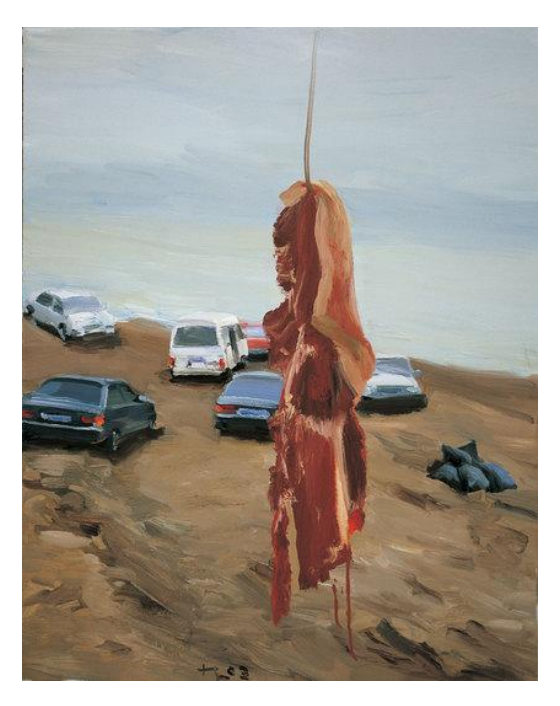
A Bunch of Pork at River, Liu Xiaodong, 2003, oil on canvas