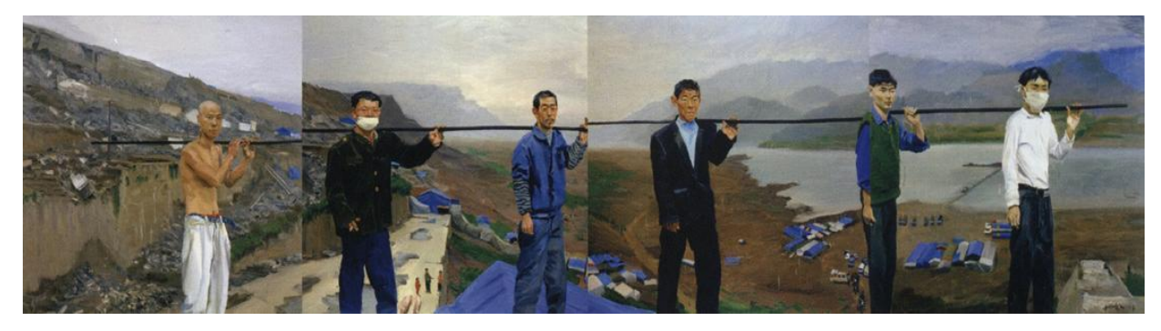
Great Migration at the Three Gorges, Liu Xiaodong, 2003, oil on canvas

As I have mentioned before, Liu's practice of combining fragments from photographs is also applied in this painting, which results in an abrupt disconnection between figures and landscape. Without the reference of Three Gorges in the title, no direct association of that region can be made from only viewing the painting. The landscape only functions as a backdrop behind the human figures. Instead of responding to the alteration of landscape, Liu primarily focuses on human activities and represents a chaotic scene of a variety of people in this painting. This group of six labors is placed dominantly in the foreground. They are neither situated in the landscape nor interacting with it. Their distinctive costumes, motionless gestures, and emotionless facial expression, all make it as a staged performance.